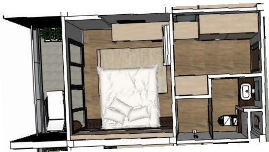
Superior Room 28.17 sqm.