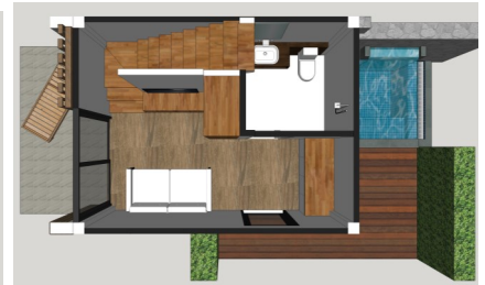
Plunge Pool Suite Villa 48.12 sqm.