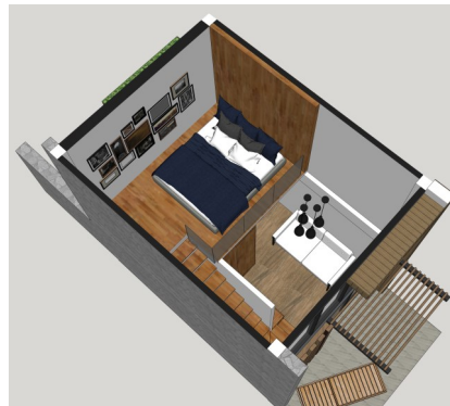
Suite Villa 34.24 sqm.